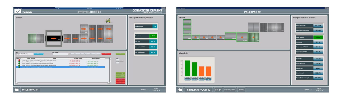
Monitoring key parameters: process steps, alarms and current machine data.