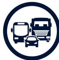
PUBLIC TRANSPORT & TRAFFIC