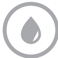
WATER & WASTEWATER